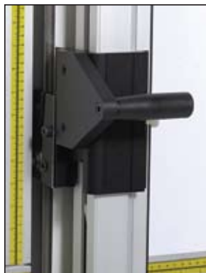
Twin Wheel Carriage Assembly Model# 69111 $240