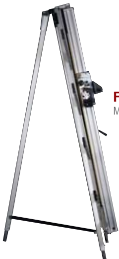
Free Standing Kit Model# 66002 $240

For shearing 1/8" masonite®, heavy mat board, 3/8" Sintra® and 3mm aluminum composite.