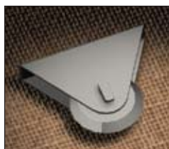
Tungsten Carbide Glass Wheel Model# 69114 $15