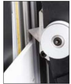
Excalibur 1000 Cutting Head

Mounts to the wall at the top end only, two telescopic legs can adjust upon installation to suit the height of the user. To use the Excalibur in the middle of workshop floor, specify the optional free-standing kit.