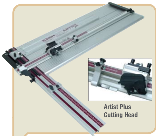
Artist Plus Cutting Head

The optional instant clip-on clip-off right squaring arm with repetition stop is provided to accurately size all matboards from 90cs (36") down to 4cm (1.4").